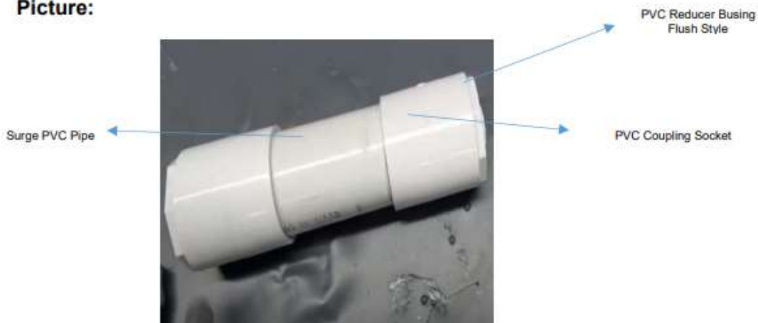
Fig 1.0 (Surge Tank Complete Assembly)

Figure 1 describes the parts needed to assemble the Surge Tank